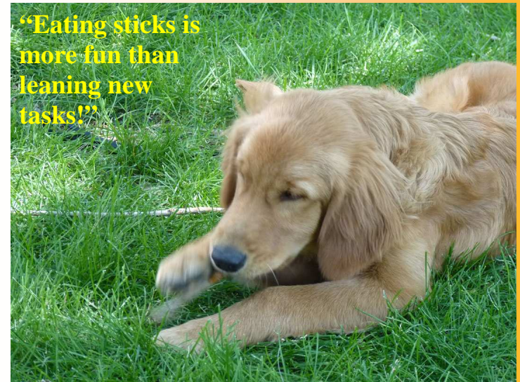
“Eating sticks is more fun than leaning new tasks!”