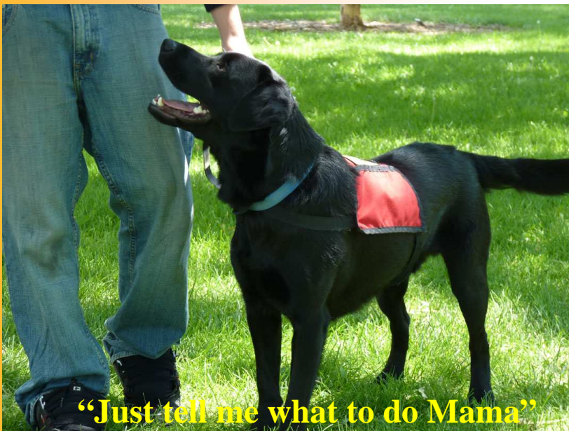
“Just tell me what to do Mama”